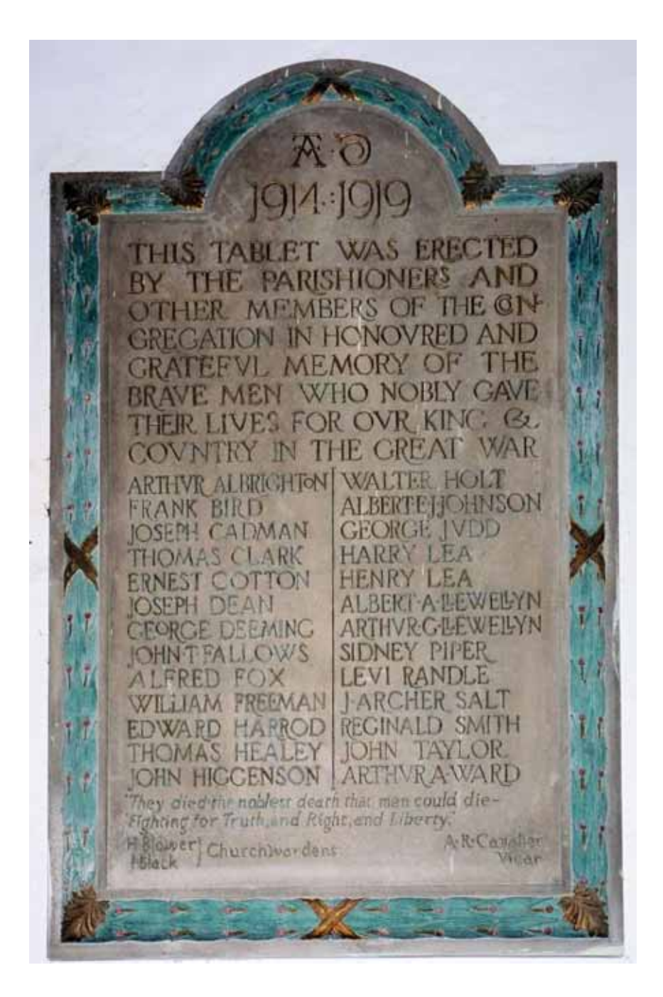
Mancetter – Memorial in St Peter's Church