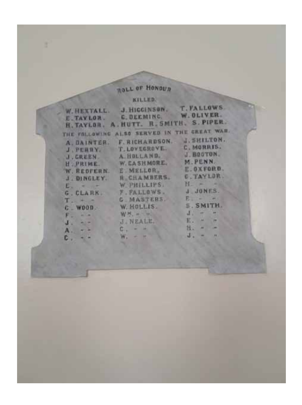
Ridge Lane – Memorial in Ridge Lane Methodist Chapel